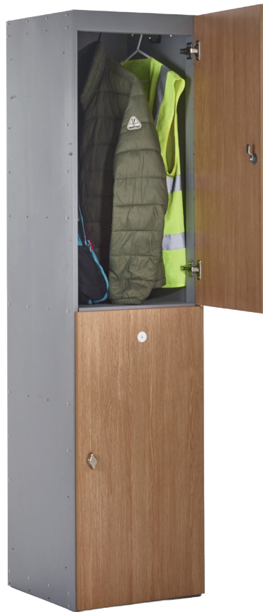
Two compartment Beech Doors Double coat hook per compartment.