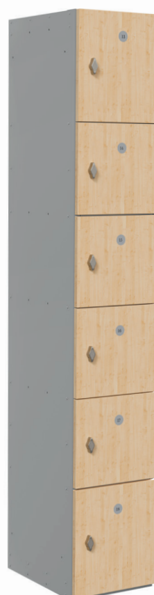
Six compartment Maple Doors