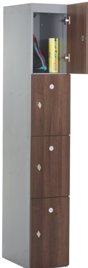
Four compartment Walnut Doors