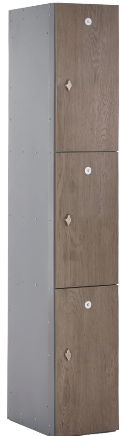
Three compartment Cannole Oak Doors